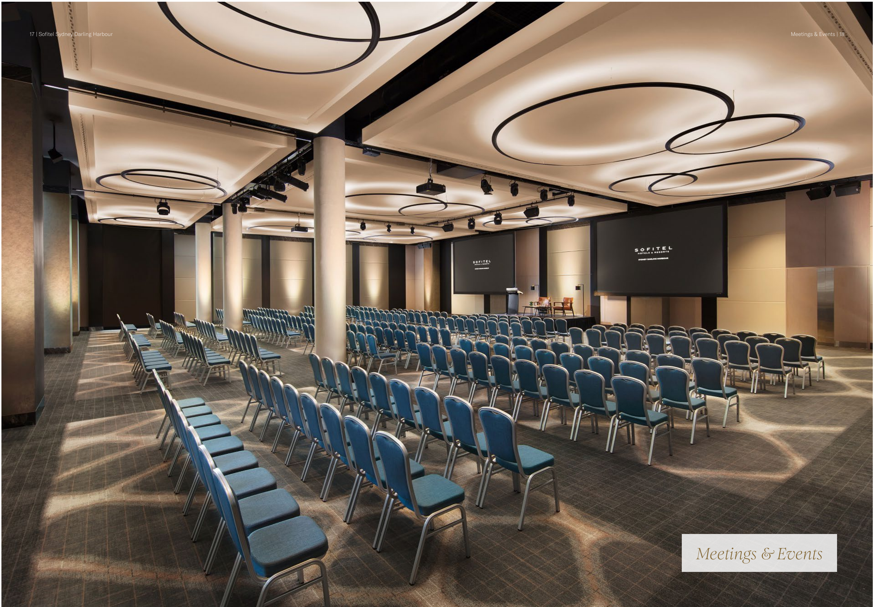
Meetings & Events