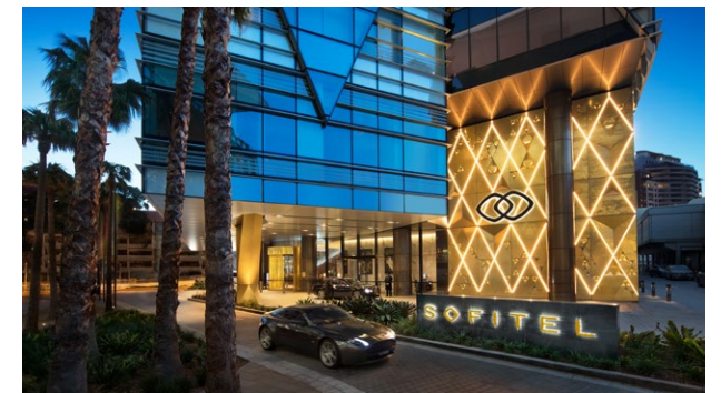
Sofitel Sydney Darling Harbour exterior