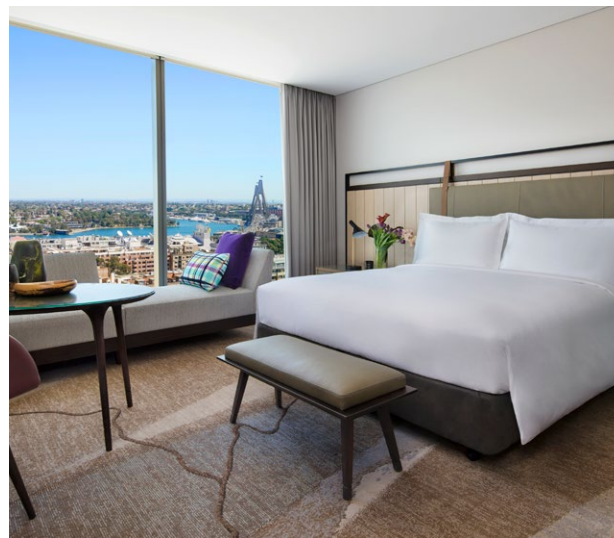
Superior room, 1 King Size Bed

Give your Sydney journey a sophisticated setting by choosing a beautiful harbour-side haven.