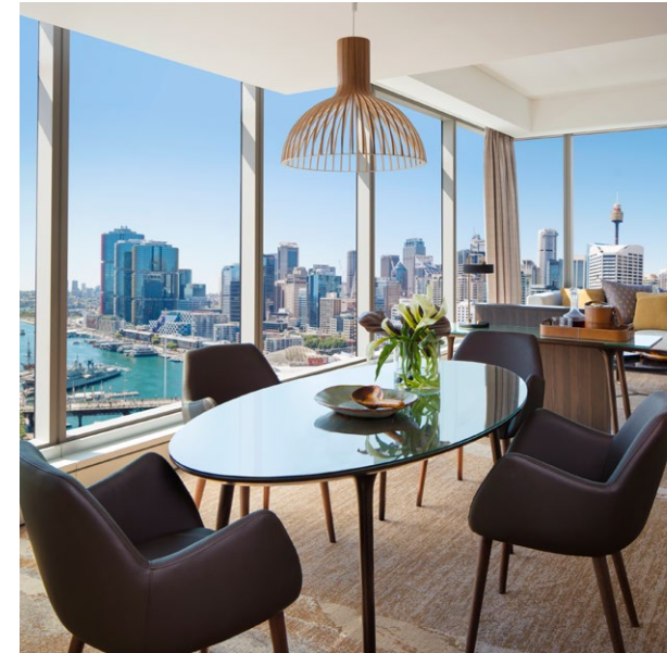
Infinity Pool - #1 Hotel Pool in Australia for 2023 &amp; 2024