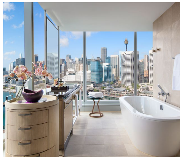
Infinity Pool - #1 Hotel Pool in Australia for 2023 &amp; 2024